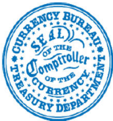
Acting Comptroller of the Currency

IN TESTIMONY WHEREOF, today, January 19, 2022, I have hereunto subscribed my name and caused my seal of office to be affixed to these presents at the U.S. Department of the Treasury, in the City of Washington, District of Columbia.